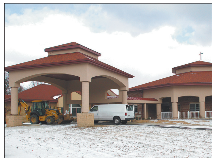
The Antonine Sisters will have an open house for its $9 million assisted-living and memory-care center on Lipkey Road in North Jackson from 1 to 5 p.m. Jan. 18.