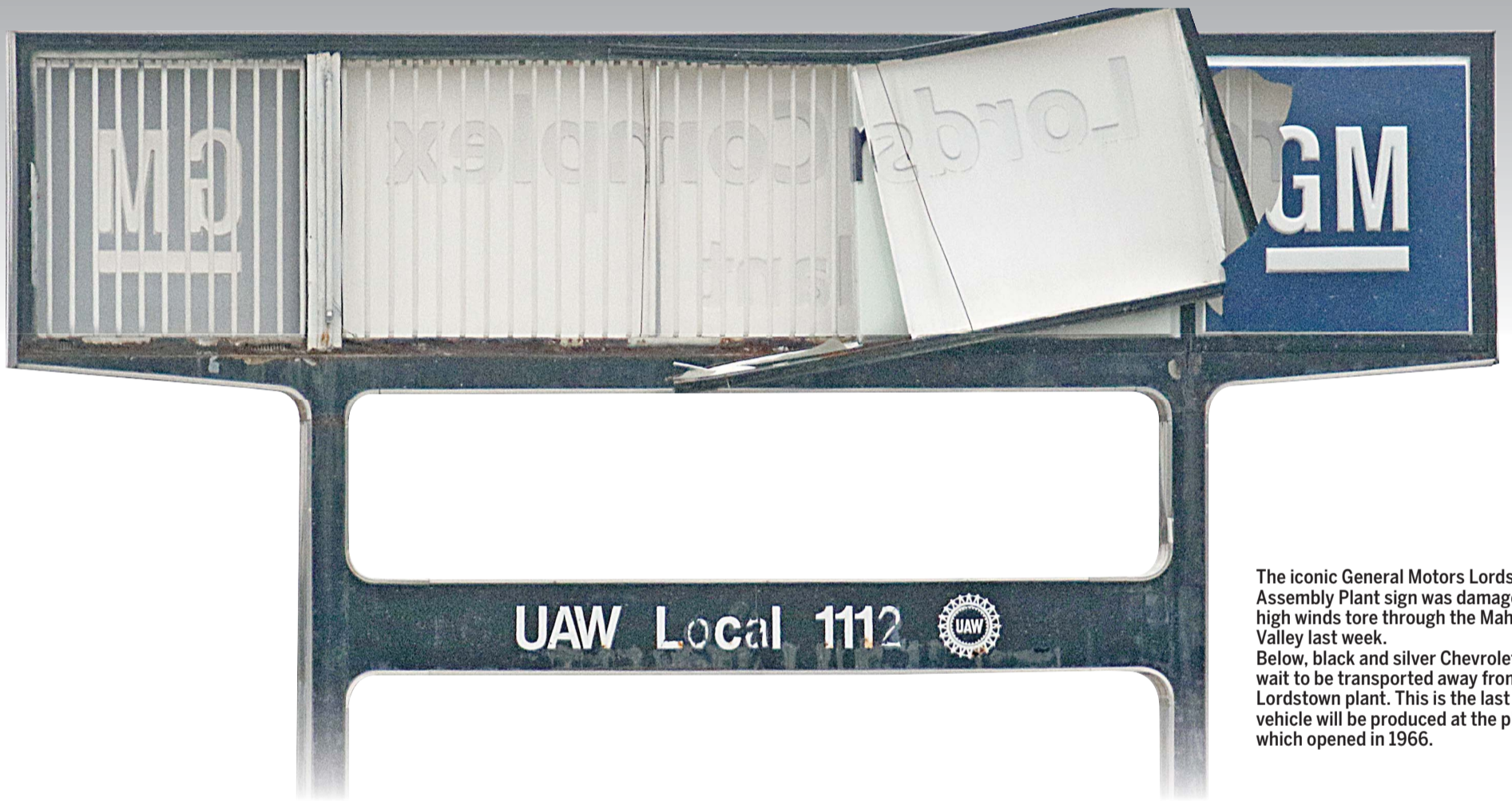
The iconic General Motors Lordstown Assembly Plant sign was damaged after high winds tore through the Mahoning Valley last week. Below, black and silver Chevrolet Cruzes wait to be transported away from the Lordstown plant. This is the last week the vehicle will be produced at the plant, which opened in 1966.