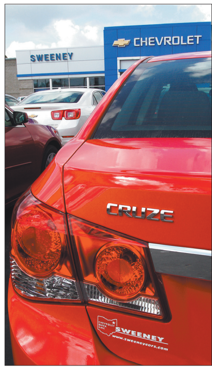
A Chevrolet Cruze on sale at Sweeney Chevrolet in Boardman on Tuesday.

Sales of the Lordstown-built Chevrolet Cruze hit an all-time low in September, when they tumbled by 50 percent from a year earlier. It was the worst month in its three-year history, other than the three months after its launch in 2010.