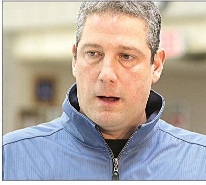
U.S. Rep. Tim Ryan of Howland, D-13th, spoke at the United Auto Workers Local 1112 hall in Warren on Monday. He was sharply critical of both GM and President Donald Trump's failure to deliver on promises to save auto jobs in the Valley.

That hope grew dimmer Monday, however, with GM's announcement that it will indefinitely halt