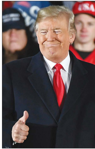
President Donald Trump gestures during a rally on Monday in Tupelo, Miss.